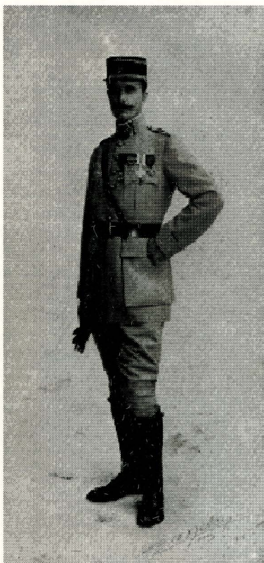
Paul Pelliot in 1916

Although there are some Sanskrit pieces from Cave 17, most of the 4,000 pieces of the Pelliot Sanskrit collection were found in the oasis of Kucha, mainly at Duldur-aqur, near Kumtura, while the wooden slips were excavated at Subashi, near Kucha. The documents of the Fonds Pelliot koutchéen are written on wood or paper, and comprise about 2,000 pieces, most smaller than a pôthi leaf. They come from different sites in the oasis of Kucha, such as Duldur-aqur and Saldirang.