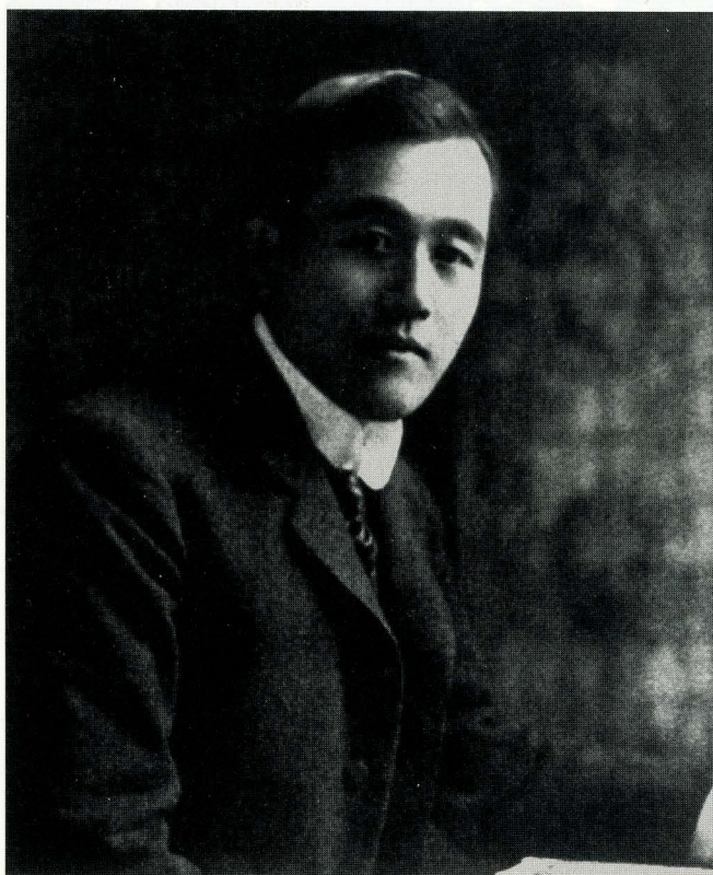
Count Otani in 1901 in London at the age of 26