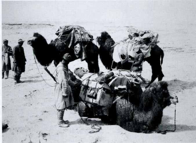
The Hedin expedition in 1901 near Lop Nor.