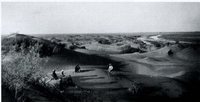
Landscape and figures along the Tarim River on Hedin's Second Expedition, 1900.

斯文赫定的第四次探險，也是最後一次探險，持續八年（1927-1935）。這是一次非常成功的探險。考察區域覆蓋內蒙古、新疆及西藏北部。這次斯文赫定率領的是一支由不同國家、不同領域的青年學術精英組成的學術考察團。這次考察的目標是地質學及其相關的其他學科，但是斯文赫定還是吸收了人種學家和考古學家隨