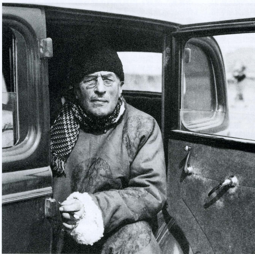
Sven Hedin in his car during his last expedition, Inner Mongolia 1934

Sven Hedin (1865–1952) spent almost twenty years of his life on Asian soil. Originally, he aspired to follow the path of other late nineteenth century Swedish explorers and engage in polar research. But an offer to serve as private teacher to the son of a man who worked in the naphtha fields of the Nobel family in Baku directed his attention to Asia. After completing his work he embarked on a ride through Persia, which taught him how to endure both physical and economic hardship en route.