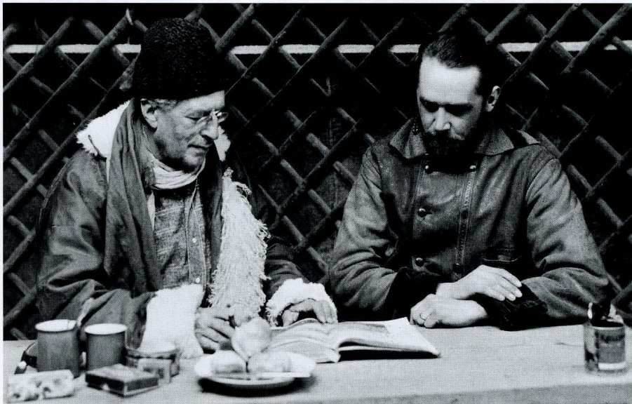
Hedin with Folke Bergman on Hedin's final expedition, 1934.

波斯之旅促使斯文赫定的興趣轉向亞洲的民族和文化。回國之後用旅行報告的文風撰寫的《波斯、美索不達尼亞、高加索游記》，使他成為當時最受歡迎的探險作家。他豐富的著作、巡回演講所獲得的收入除維持家庭生活之外，還用作將來探險的費用。他一生從未擔任任何公職，也沒有在大學任職。