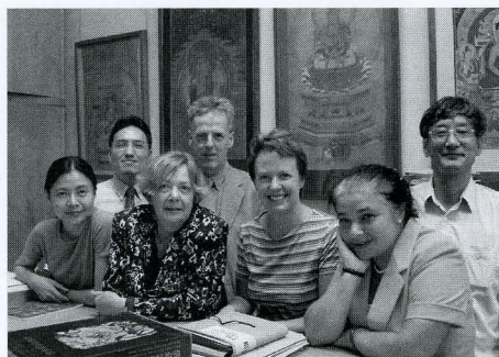
Visit of IDP and the Chiang Ching-Kuo Foundation to the State Hermitage Museum, St. Petersburg.